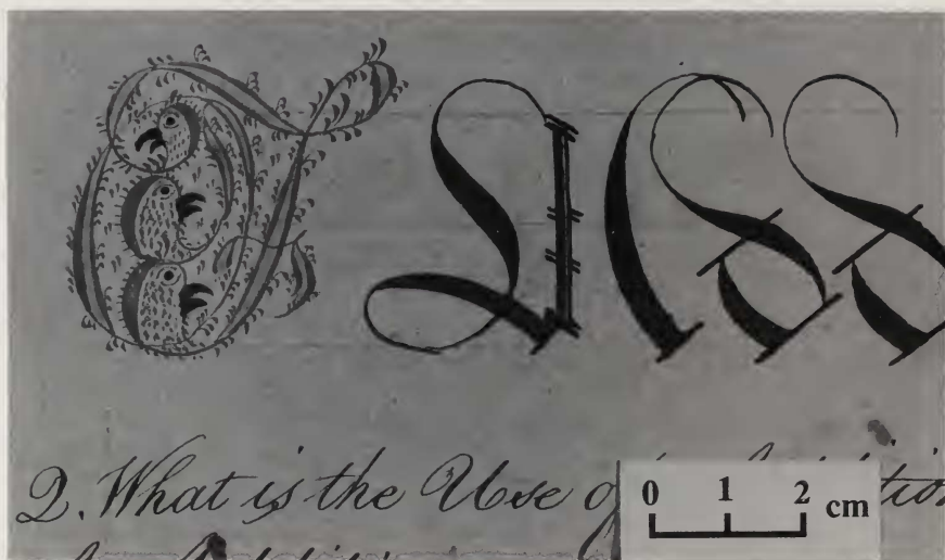
FIG. 3. "Of Add(ition)" combines linked lettering decorated with birds, interior detail, large and small flourishes, and black, broken lettering.